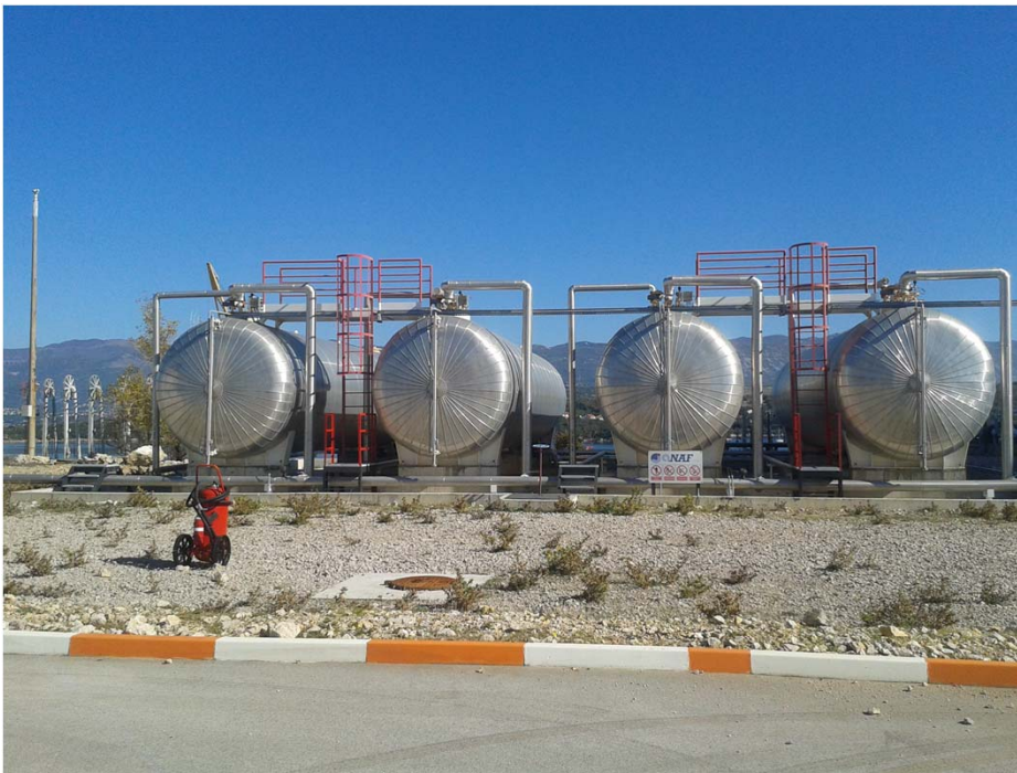
Capacities for bio-fuel JANAF d.d. Omišalj