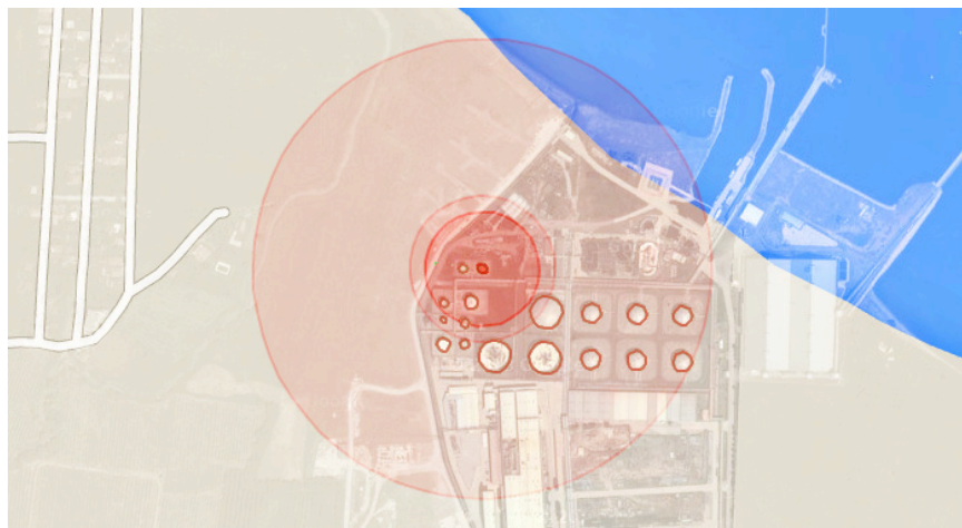
Figure 6: RAPID-N output for release of a flammable substance from a storage tank upon earthquake impact.

A new web-based system developed by the JRC assesses and maps the potential impact of natural hazards on chemical installations. Called RAPID-N, the system provides a framework for estimating the risk of hazardous-material releases following natural disasters (so-called Natech risk). It identifies Natech-prone areas and assesses the risk associated, to support land-use planning, emergency-response planning, damage estimation and early warning.