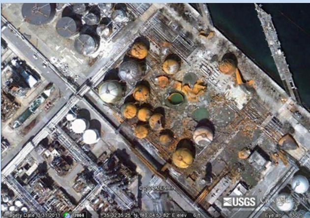
Figure 4: The LPG tank farm at the Chiba refinery after the earthquake-triggered fires and explosions (2012 Google, ZENRIN)

Similar accidents: eNatech #44 #49 #50 and #51