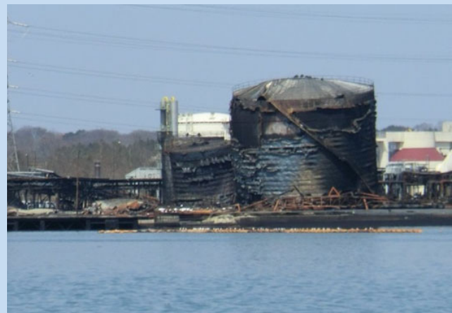
Figure 5: Burned tanks at the Sendai refinery hit by the tsunami