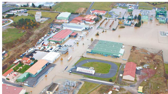
Figure 2: The affected site